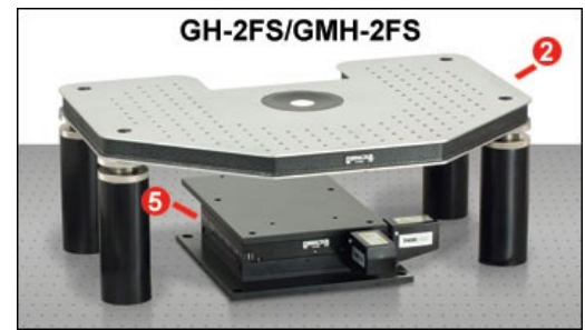
Gibraltar Platform shown with Solid Aluminum Top and No Base Plate