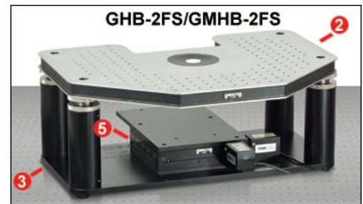
Gibraltar Platform shown with a Stainless Steel Top and No Base Plate